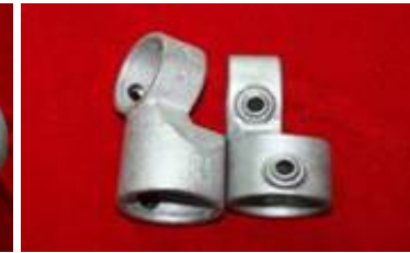
Adjustable Side-Outlet Tee