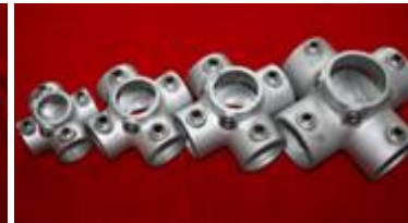
Four Socket Cross