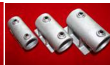
Palm Support Base