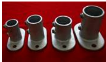
Railing Base Flange