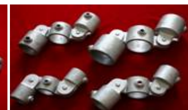
Double Swivel Socket

* The photos above show the major range of structural pipe fitting that Zoneone made. The photos were taken on the actual production.